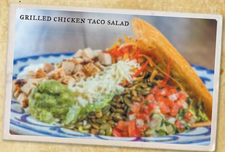
GRILLED CHICKEN TACO SALAD

Homemade tostada taco shell filled with romaine lettuce, refried beans, pico de gallo, cotija and jack cheese. Topped with grilled chicken, roasted pepitas, sour cream, guacamole and your choice of dressing. 14.99