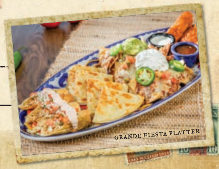
GRANDE FIESTA PLATTER

• Mexico City Flautas • Buffalo Chicken Tenders • Nachos Supremos • Cheese Quesadilla Served with fresh guacamole and dipping sauces. 17.99