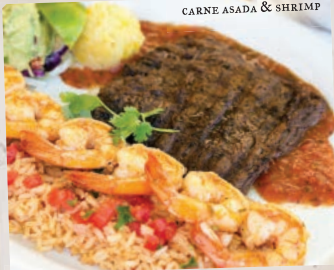
CARNE ASADA & SHRIMP