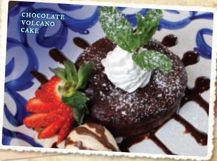
CHOCOLATE VOLCANO CAKE

Rich chocolate cake served warm with a scoop of vanilla ice cream, chipotle-chocolate sauce and whipped cream. 9.49