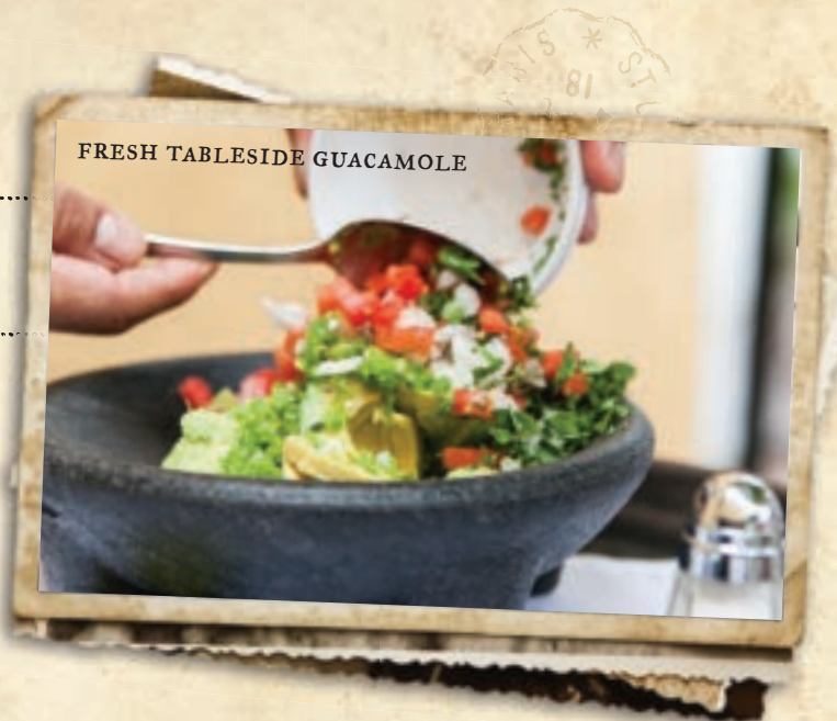
FRESH TABLESIDE GUACAMOLE

Grilled Chicken add .99 • Grilled Steak* add 1.99