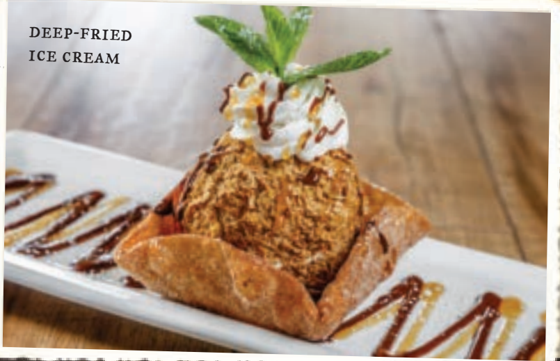
DEEP-FRIED ICE CREAM

Vanilla ice cream in a cinnamon-sugar coating with chipotle-chocolate sauce and whipped cream. 6.49