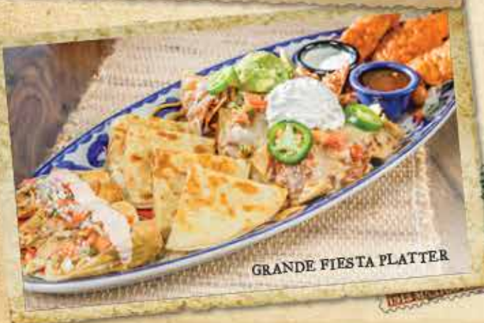
GRANDE FIESTA PLATTER

• Buffalo Tenders or Wings • Crispy Flautas • Nachos Supremos • Cheese Quesadilla Served with guacamole and dipping sauces. 16.99