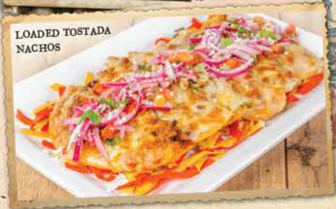
LOADED TOSTADA NACHOS