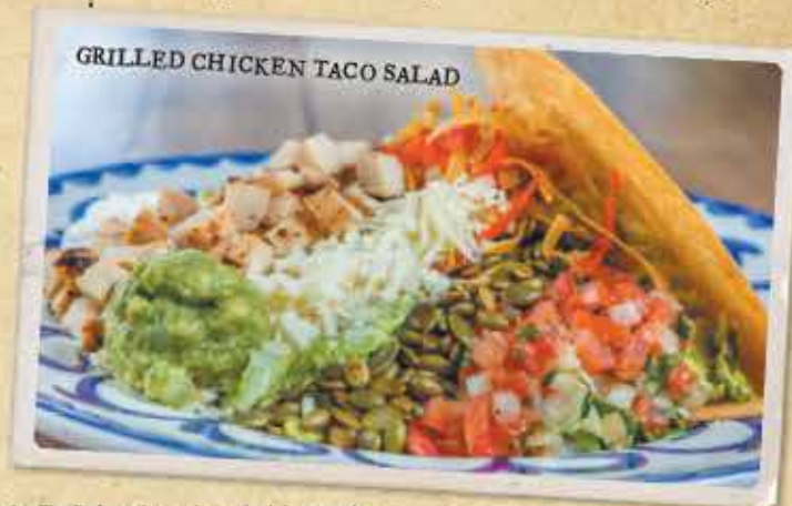
GRILLED CHICKEN TACO SALAD

Homemade tostada taco shell filled with romaine lettuce, refried beans, pico de gallo, cotija and jack cheese. Topped with grilled chicken, roasted pepitas, sour cream, guacamole and your choice of dressing. 14.99