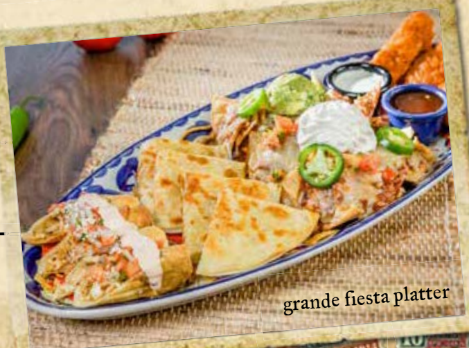
grande fiesta platter

Served with fresh guacamole and dipping sauces. 16.99