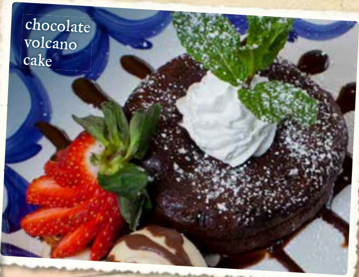
chocolate volcano cake

Rich chocolate cake served warm with a scoop of vanilla ice cream, chipotle-chocolate sauce and whipped cream. 8.99