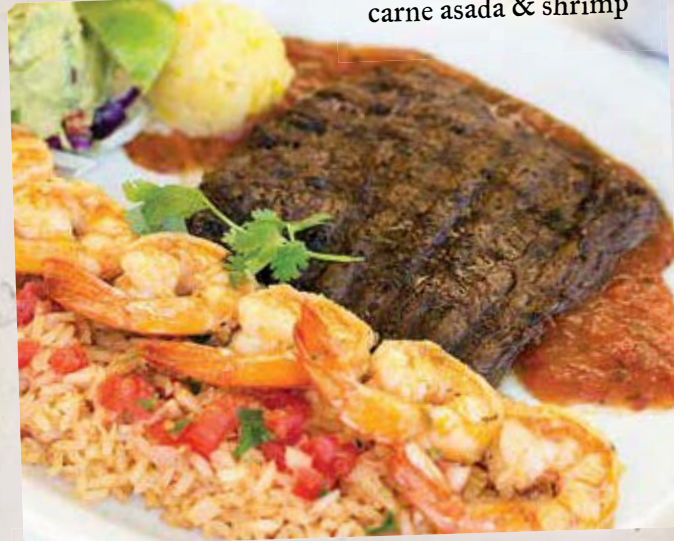
carne asada & shrimp