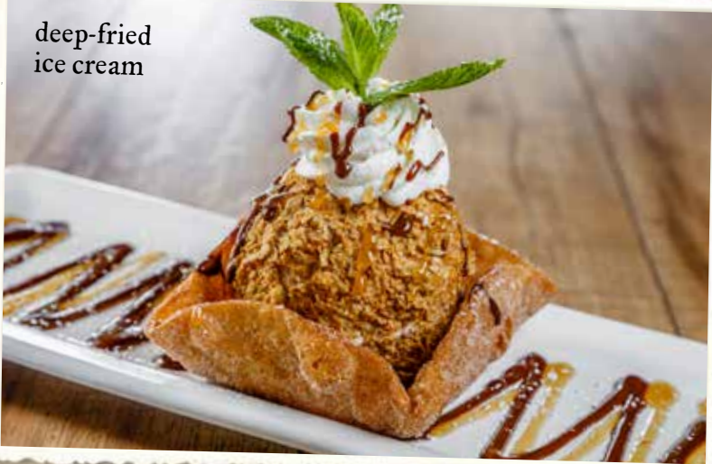
deep-fried ice cream

Vanilla ice cream in a cinnamon-sugar coating with chipotle-chocolate sauce and whipped cream. 5.99