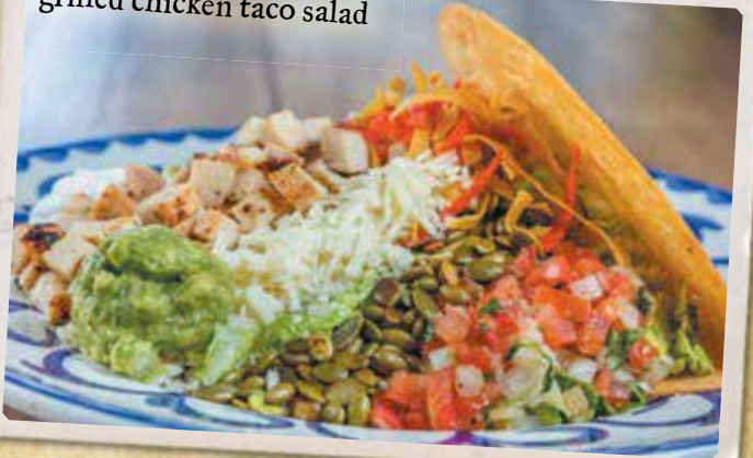
grilled chicken taco salad

ADD SOUP OR MEXICAN CAESAR SALAD TO ANY ENTRÉE FOR 3.99